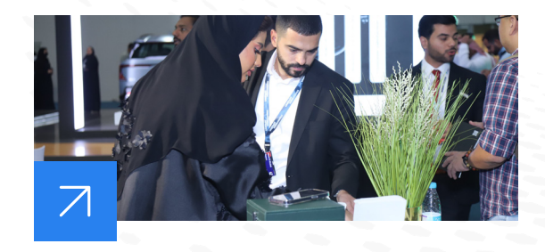
Generate qualified business leads