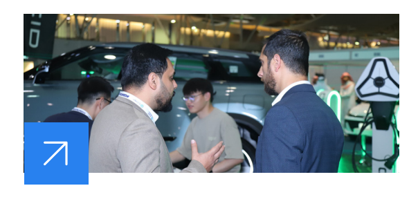
Solidify your business network