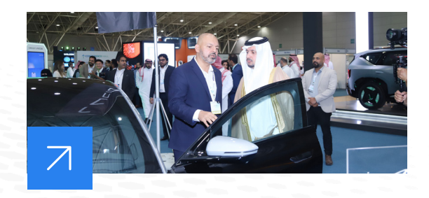
Gain Inspiration and Insights